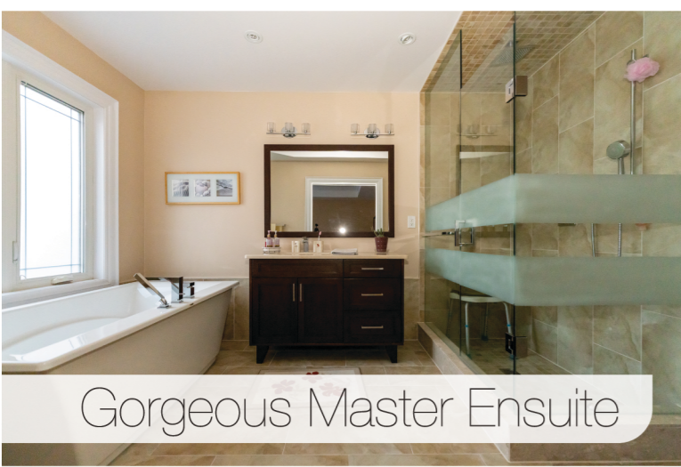
Gorgeous Master Ensuite