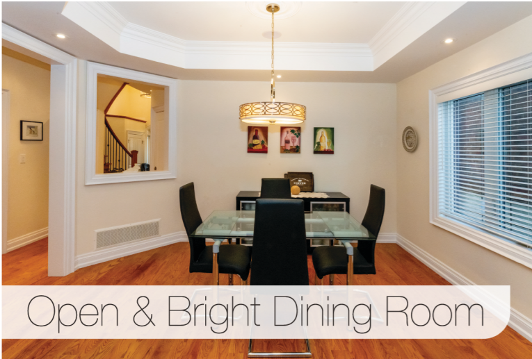
Open & Bright Dining Room