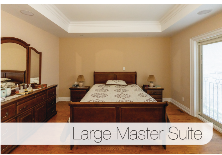
Large Master Suite