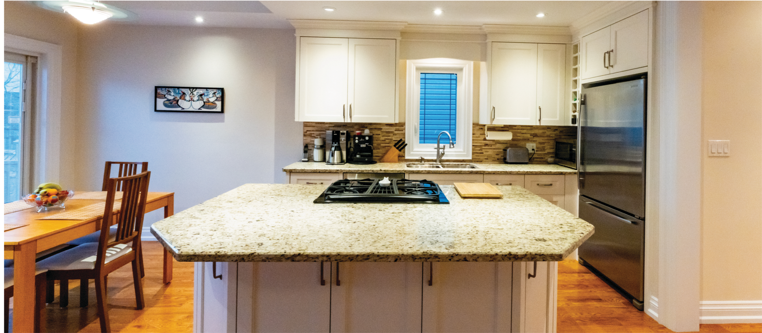
Fabulous Open Concept Kitchen to Living & Dining Area